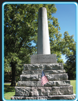
A Companion to Meriwether Lewis: The Assassination of an American Hero and the Silver Mines of Mexico